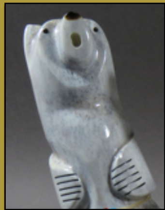
Detail: singing dancing bear