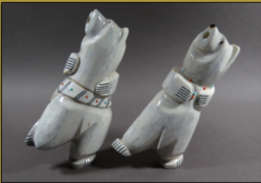
L-R 5 ½ “ tall — singing (soccer and strutting) $240 each