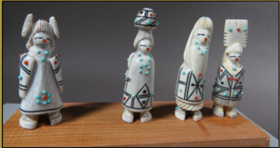
Maiden group on cedar base 2" tall $500