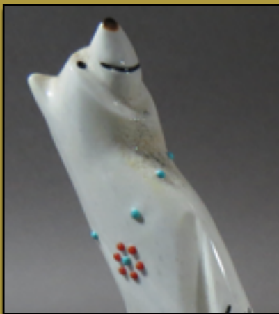
Detail: happy necklace bear