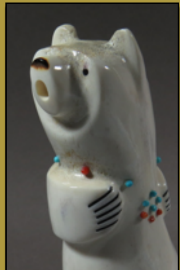
Detail - Opera Singer