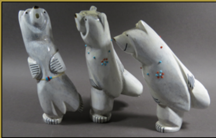
L-R all 6 ½ “ tall (dancing)— singing $260; singing $280; smiling $260