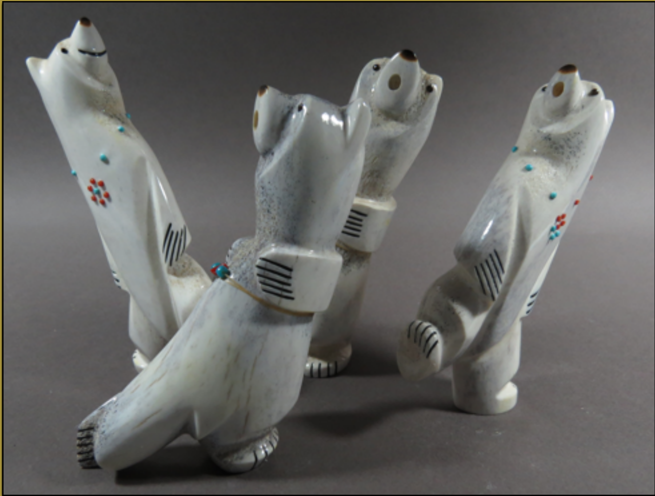
L-R all 5 ½ " tall — $180 each