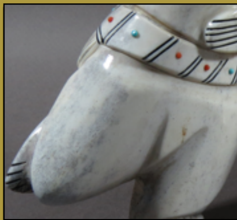
Detail : Soccer bear with sash