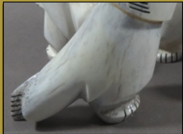
Detail: foot shuffle